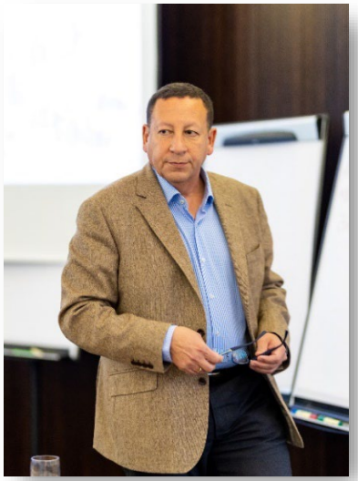
Fig.11. Morning Session of the European National Societies Meeting – Lausanne, November 2022