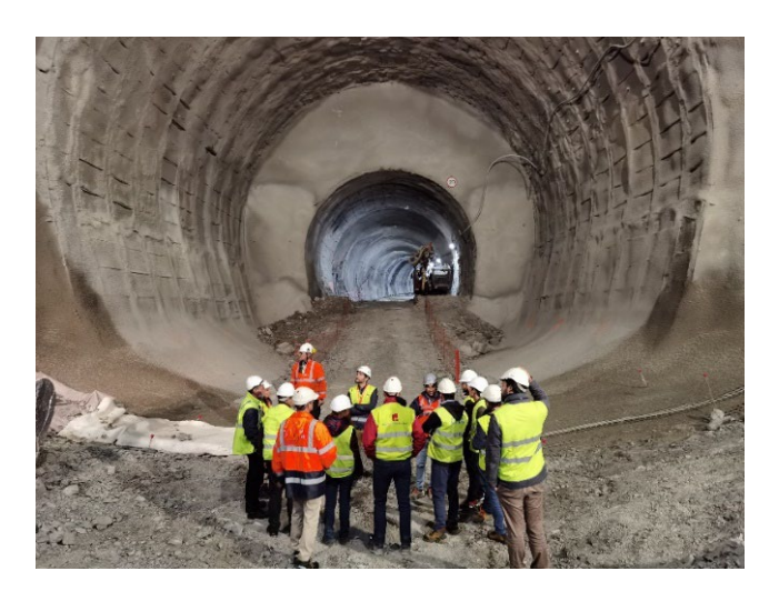
Fig.8. Image of the excavation of the Lisbon metro lines.

In the morning of November 26, a technical visit to the works on the Lisbon Underground's Circular Line, Lot 1, took place (Figura 8).