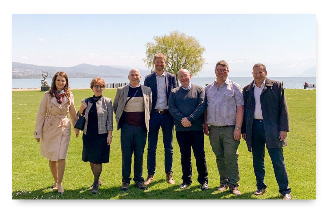
Fig. 10. Kick-off Meeting of the European Support Group – ESG – Lausanne, April 2022

The Group's inaugural meeting was in April 2022 in Lausanne, Switzerland, where they discussed the five objectives with the ambition to hold a meeting of the national societies of ISSMGE Europe later in the year.