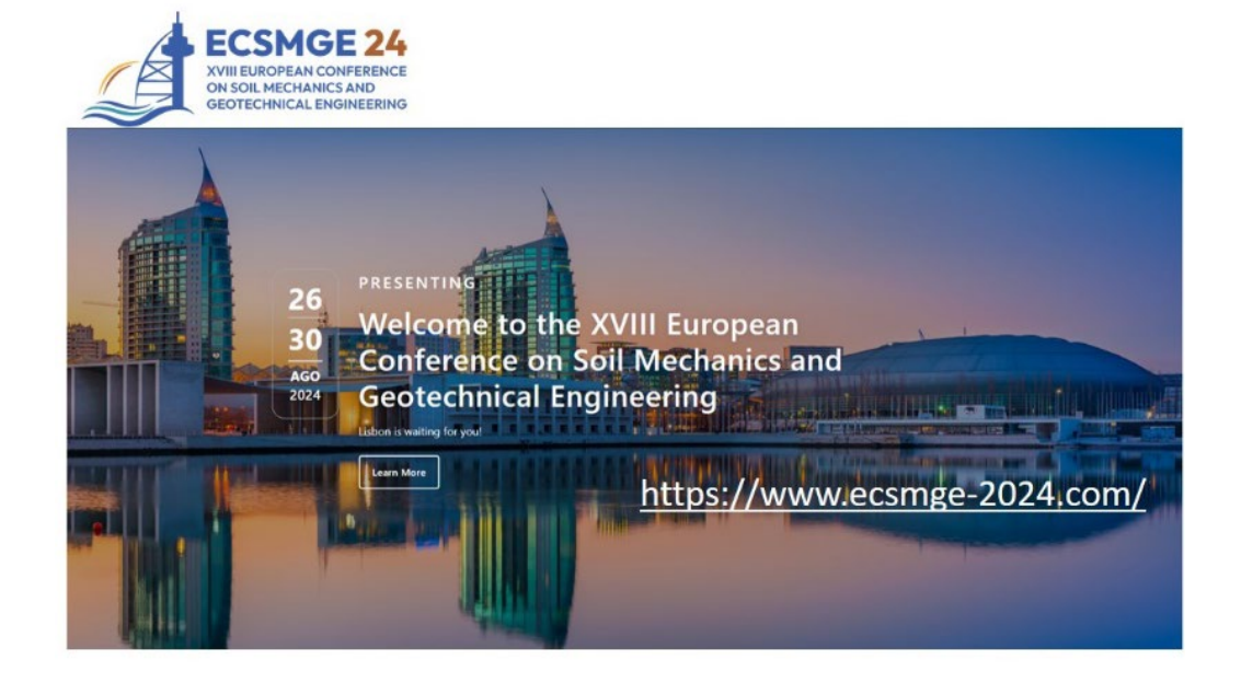
Fig.9. Image of the excavation of the Lisbon metro lines.

Portugal is preparing for the upcoming XVIII European Conference on Soil Mechanics and Geotechnical Engineering (Figure 9) (ECSMGE 2024, <a href="https://www.ecsmge-2024.com/abstracts/important-dates">https://www.ecsmge-2024.com/abstracts/important-dates</a>).