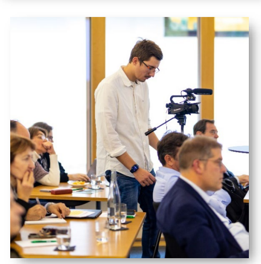
Fig.13. Afternoon Session – Hybrid Event dedicated to Innovation in Geotechnical Engineering – Lausanne, November 2022